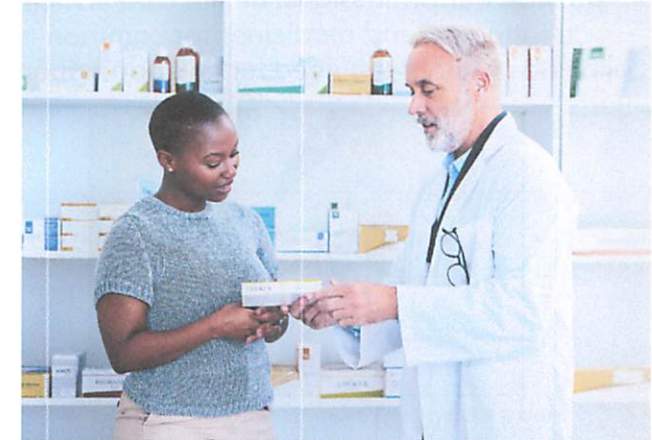
Photo 287734957 / Consultation